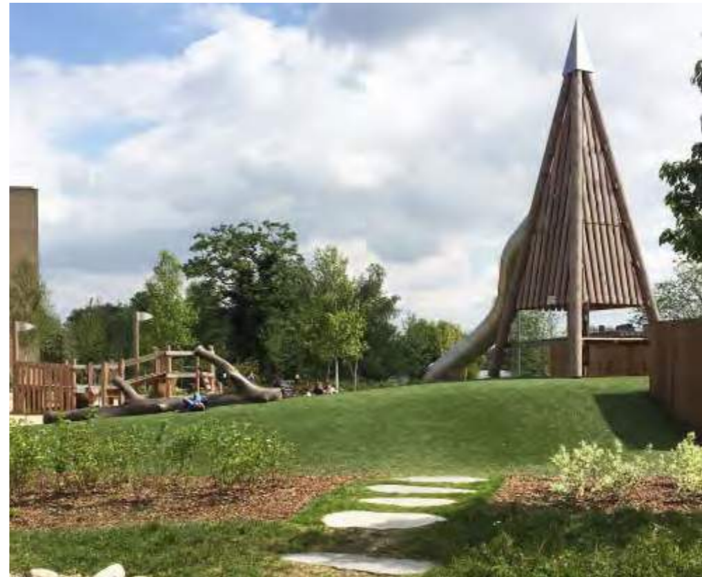
Improved Grove Farm parkland