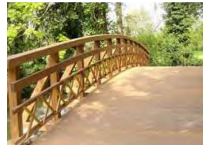
Options for pedestrian bridge